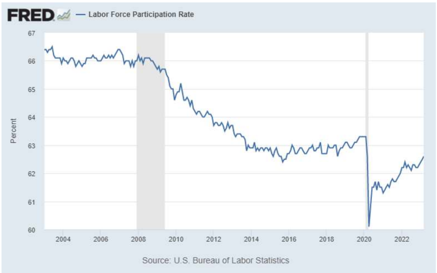
Bureau of Labor Statistics, Civilian labor force participation rate, accessed April 18, 2023 https://fred.stlouisfed.org/series/CIVPART .

Though the U.S. population has increased by 87 percent since 1960, the number of DI beneficiaries has increased by a staggering 1,743.87 percent. [356] [357] Similarly, in the last generation, the labor force participation rate has plummeted to just 62.5 percent. [358] Put simply, there are fewer tax-paying workers supporting a growing non-working population. Not only is this a recipe for economic stagnation, but it robs individuals of the happiness and fulfillment that comes from the dignity of work. Further, small businesses remain desperate to find workers to fill job openings, with BLS recording 10.8 million job openings in January 2023. [359] Allowing Americans who can work to languish in government dependency is both unsustainable and immoral. It is necessary for policymakers to help connect those who can work but are receiving government assistance with available jobs.