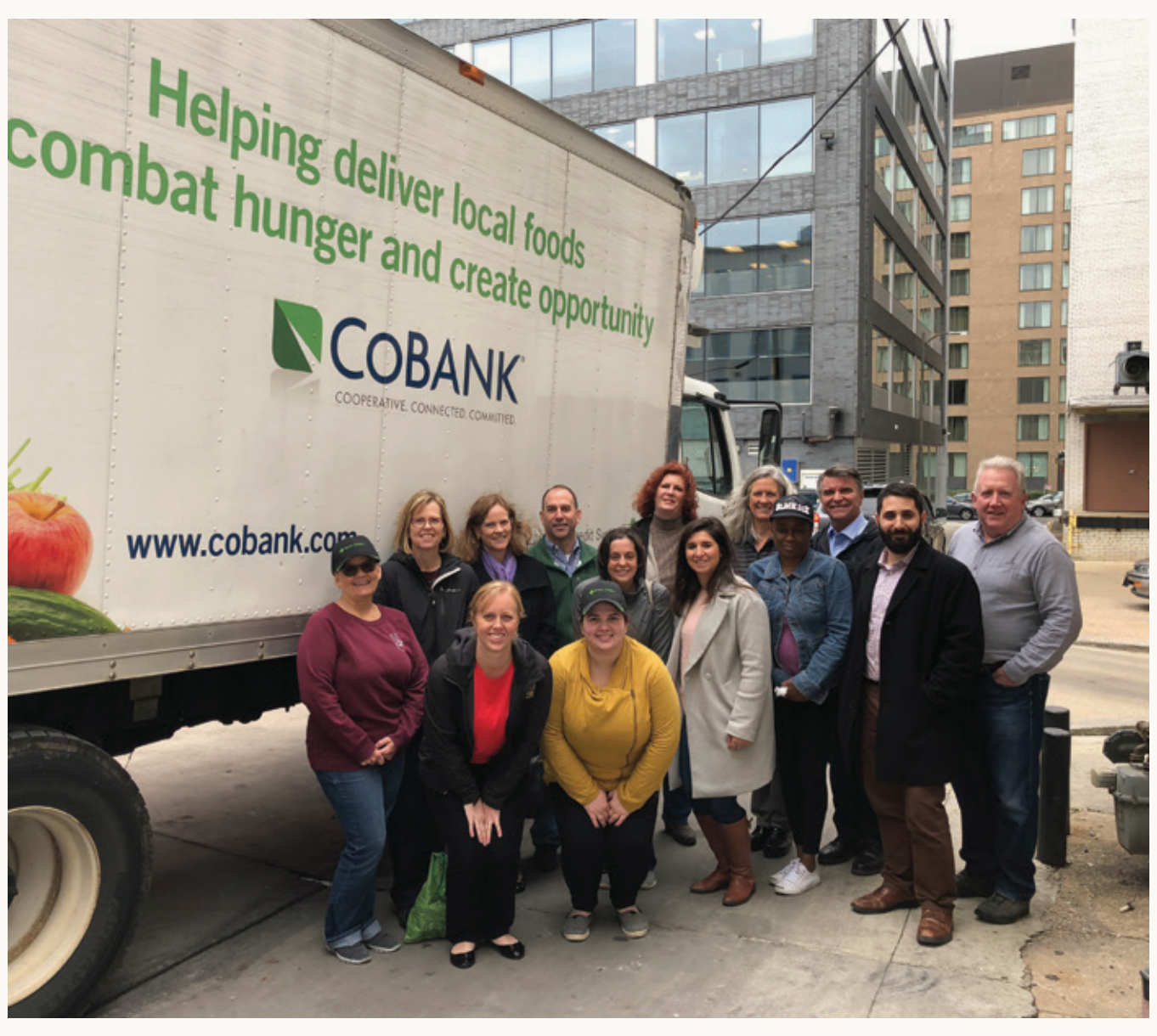
The \ Washington, D.C.\ co-op\ community\ joined forces\ to\ combat\ hunger\ and\ food\ waste\ by\ volunteering\ at\ the\ D.C.\ Central\ Kitchen\ in\ December.

CoBank also supports DCCK's work to source local produce for school food and the Healthy Corners program on an ongoing basis. DCCK sources ingredients from more than 30 local family farms to scratch cook high-quality, nutritious school meals. The Healthy Corners program delivers fresh produce and healthy snacks to corner stores in D.C.'s food deserts. CoBank not only funds DCCK, but has an associate serving as the chairman of the board.