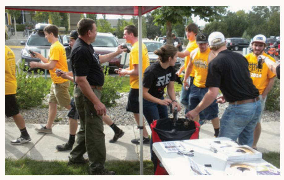
Whether providing \ milk\ to\ kids\ at\ a\ basketball\ tournament\ in\ Washington\ or\ handing\ out\ milk\ at\ a\ RE: FUEL\ event\ in\ Montana,\ Darigold\ employees\ consistently\ show\ up\ to\ give\ back\ to\ their\ local\ communities.