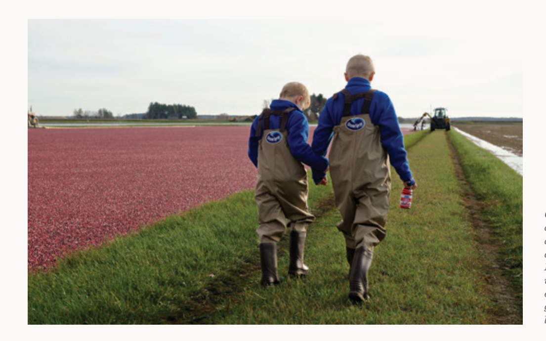
Ocean Spray is not only committed to its own members and their families but the co-op also leverages its Community Fund to provide funding and volunteer support to nonprofit organizations in areas where grower-owners and employees live and work.

Another program, "From the Ground Up," educates community members throughout southeast and south-central Texas about agriculture's impact on their everyday lives. For the past 19 years, discussions touch on everything from how our food and fiber is produced to technological advancements coming out of the lab to rural policy decisions being made in the legislature.