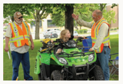
Whether through supporting students pursuing degrees in agriculture, packing backpacks for kids in need or teaming up with local co-ops to host ag safety days, CHS Inc. and the CHS Foundation take pride in supporting community-building efforts that extend the co-op's positive impact in hometown communities.