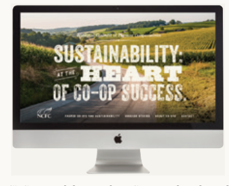
NCFC's Sustainability Working Group gathered in Arkansas in October to share ideas, learn from experts and provide guidance for future NCFC sustainability efforts. The group has played an integral part in helping NCFC develop resources for its members, including co-op sustainability.org, a website showcasing farmer co-ops' sustainability efforts.