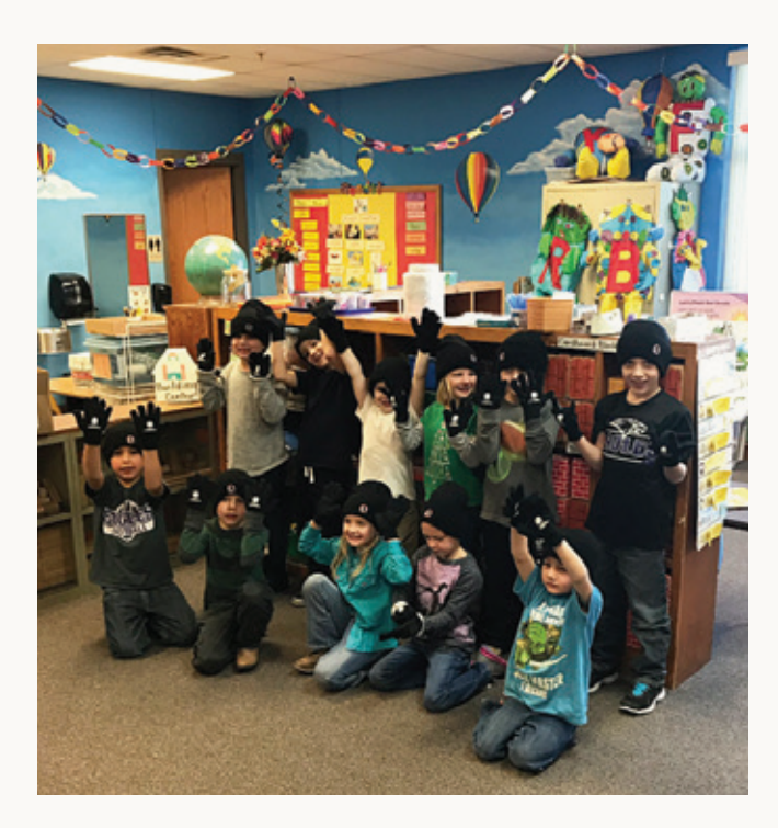
Kindergarten students in Bertrand, Nebraska, model the winter hats and gloves hand delivered by Aurora Cooperative staff.

Other Aurora member co-ops soon started following the Bertrand location's example through similar drives and other initiatives in their own communities.