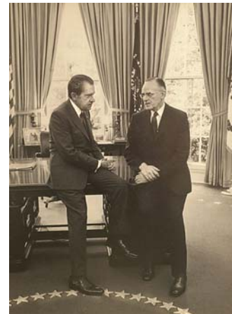
President Nixon with Secretary Butz in the Oval Office.

During his five years as agriculture secretary, net farm income more than doubled over the previous 10 years and farm exports tripled. He engineered a massive grain sale to the Soviets in 1972 and the Soviets essentially bought up the U.S. grain reserve. Much to the chagrin of environmentalists, Butz encouraged farmers to plant "fence row to fence row" to fulfill the growing demand.