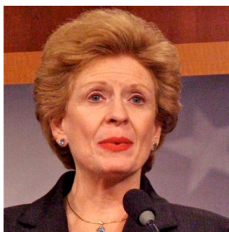
Sen. Debbie Stabenow, Chairwoman Senate Ag Committee

After the farm bill conference committee had completed its work and the House was poised to consider a final farm bill vote, Stabenow walked over to the lower chamber to watch members vote.